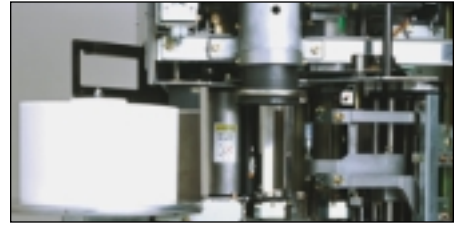
table coin wrappers / counters.

The critical elements of a wrapper's durability are alignment, center control and frame design. Glory has developed a unified frame to reduce distortion and maximize durability. The performance of the WR-400 and WR-80 will outlast compa-