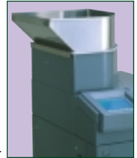
Optional extra large hopper

Optional extra large hoppers, printer, coin roll holder, material detector, remote control and large paper roll stands are available for casinos, armored couriers, and other